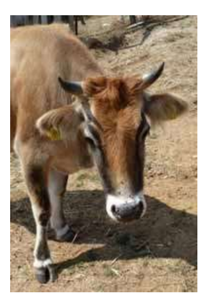
Head: - long and narrow nose, - white muzzle (white ring around the nose), - relatively large eyes