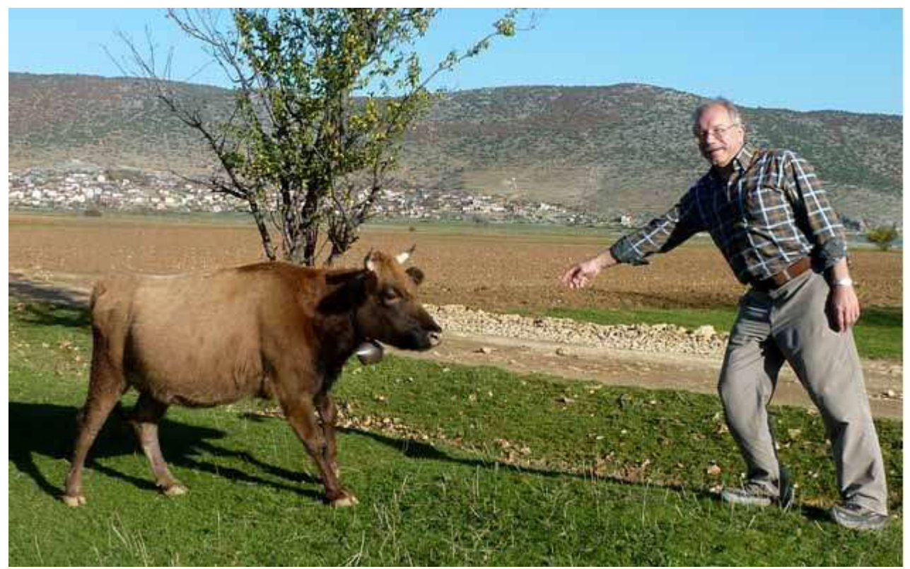
The author with a Prespa dwarf near the village of Kallamas

Special thanks go also to the institutions who have made the work possible through their financial support. These go especially to the "Fondation de Bienfaisance Jeanne Lovioz" in Basel, who supported the work in Albania, but also to the MAVA Foundation and the Grovni Foundation for setting off the whole project and supporting the work in Greece.