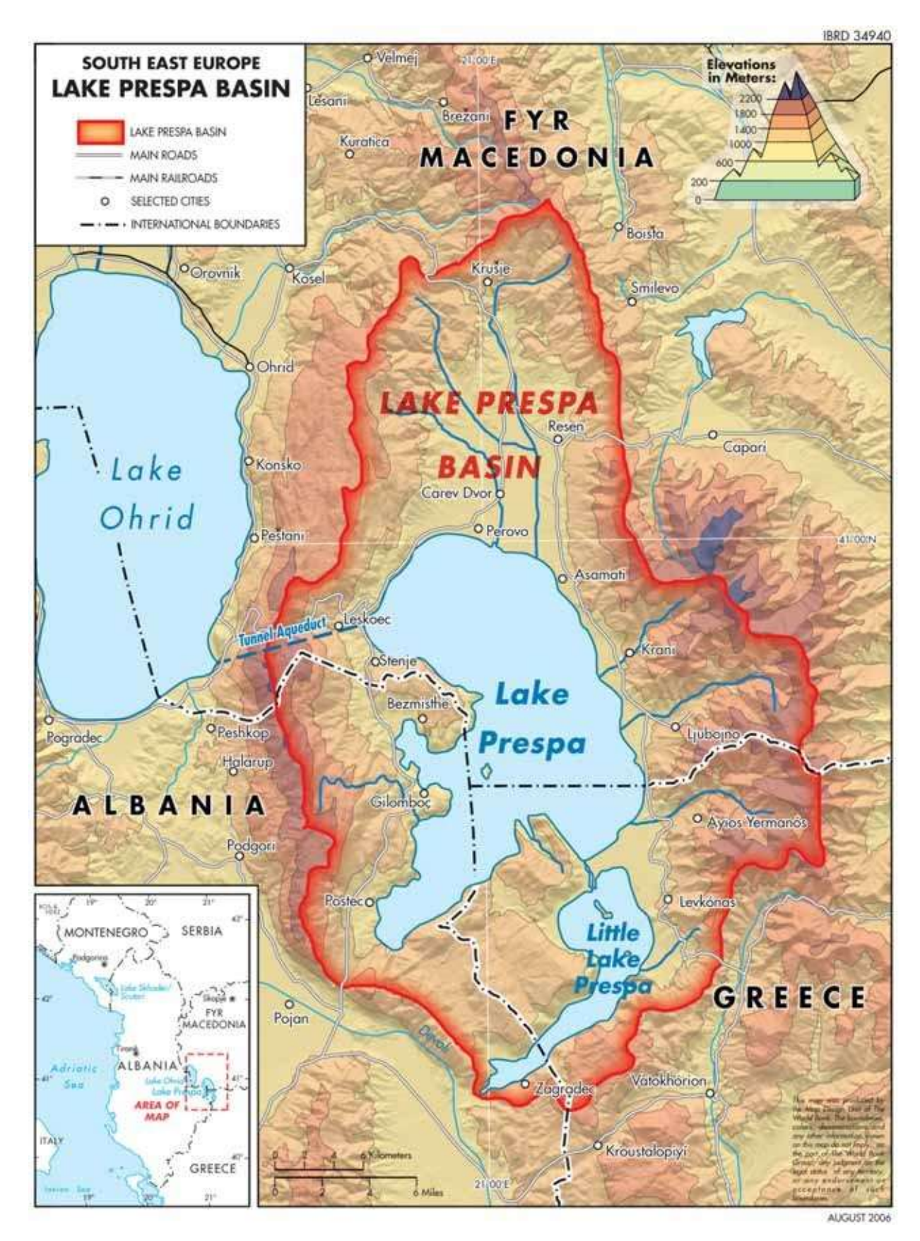
(Map produced using the Map Design Unit of the World Bank)