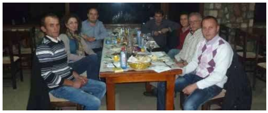
Relaxing after the workshop with members of Sun of Liqenas

In the third part of the workshop the questions around marketing of produce were addressed (see the chapter on Marketing in this report), also awareness-raising in the local populations (the help of local schools and the high school in Liqenas was offered). Questions about the possibilities to collaborate with nature protection as well as local political questions were discussed.