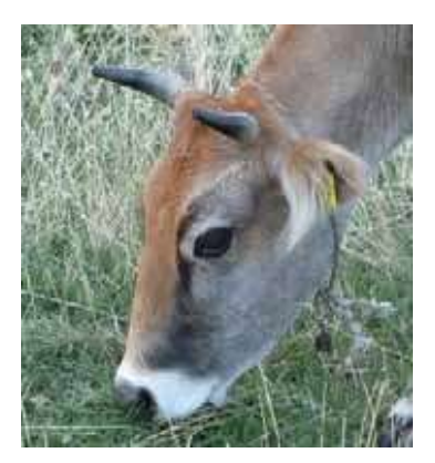
Horns: - short and bent front-inwards or up-inwards, - colour: pale grey to black or white with black tips