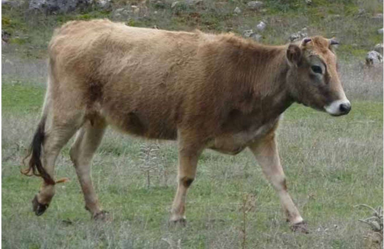
Prespa cow with the commonly found deer-like facial markings