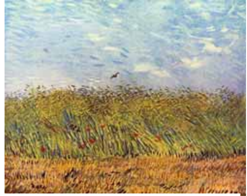
Van Gogh's "Wheatfield with a Lark" illustrates the connection between plant and nature

The interaction between wild biodiversity and cultivated plants becomes apparent through the fact that more than a third of all cultivated plants are reliant on pollination by animals. Fruit groves are of special importance for nature and landscape protection. Their usefulness for insects and birds is widely known. Traditional fruit groves, particularly standard trees, fulfil many demands and miscellaneous functions in a landscape: nesting sites, food basis, raised stands, etc. are some of the relevant aspects. Wild fruit species and varieties serve also as hideout for mammals and structure the landscape.