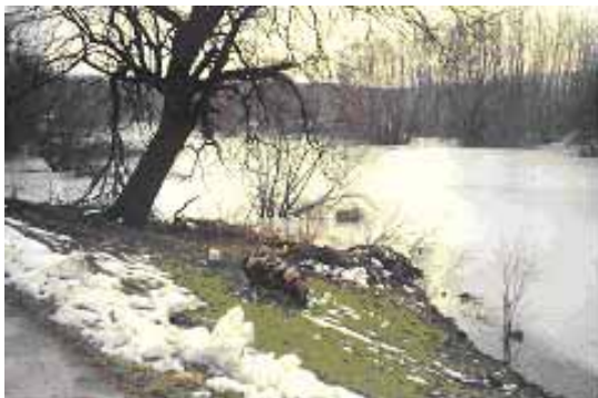
Turopolje pigs in Lonjsko Polje Nature Park in Croatia

There is a danger that the skill and knowledge needed to select the best adapted autochthonous breed for the conservation of a certain habitat is being forgotten breed diversity decreases continuously. In the upcoming countries of South and South Eastern Europe, modern performance breeds are increasingly crossbred with regional breeds. In most of these countries, neither breeds nor their characteristics and traditions linked to them have to date been recorded. As long as complex information is not available, the direct influence of a breed on natural biodiversity can barely be estimated. Traditional and sustainable utilisation systems are sometimes irreversibly weakened through social- economic change. This has diverse impacts on nature or the entity of natural resources, respectively. Well-directed recording and documentation can counteract the above described “extinction of experience”.