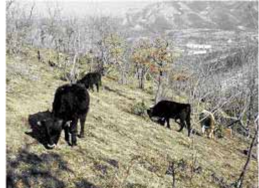
Through extensive grazing, Rhodopian cattle in Bulgaria have kept the parkland of the Rhodopes clear for centuries

Traditional cultural landscapes are an integral part of European ecosystems. Variety and species richness of regional ecosystems has developed over centuries. Many of those worth protecting are products of the interaction between nature and culture, such as e.g. poor grassland and pastures, terrace landscapes, ravines, alps and meadows on very steep slopes - elements of cultural landscapes that developed through utilisation and whose conservation requires utilisation. Particularly in spacious and remote, inaccessible areas that are to be protected, nature reserves and nature parks, economically efficient use and management are often impossible. The expense of cutting and removing hay is too cost intensive. Fallow development, vegetation encroachment and thus undesirable decrease of species diversity are the result.